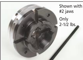
Shown with #2 jaws Only 2-1/2 lbs.

For 1 3/8" Expanding Collet Chuck Ideal for making larger bowls and 2-3/4" clocks.